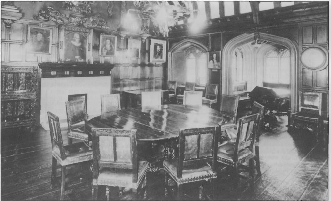
The Reading Room, Chetham's Library.