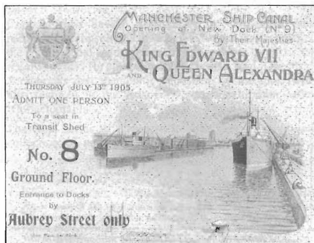
Ticket for opening of No.9 Dock, 1905.