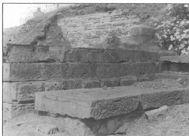
Brick pit shafts and engine bed, Tunsgill Colliery, Milnrow.