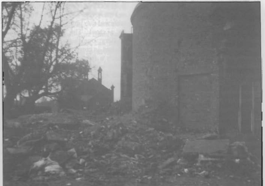
The Roundhouse in ruins.

The one form of death we envied — yes, envied — was when thin but beautiful or handsome children were taken away with consumption. They went off in motor cars — motor cars indeed! — to places called Baguley and Sandiway. No more school for them! We heard that they lay in beds on