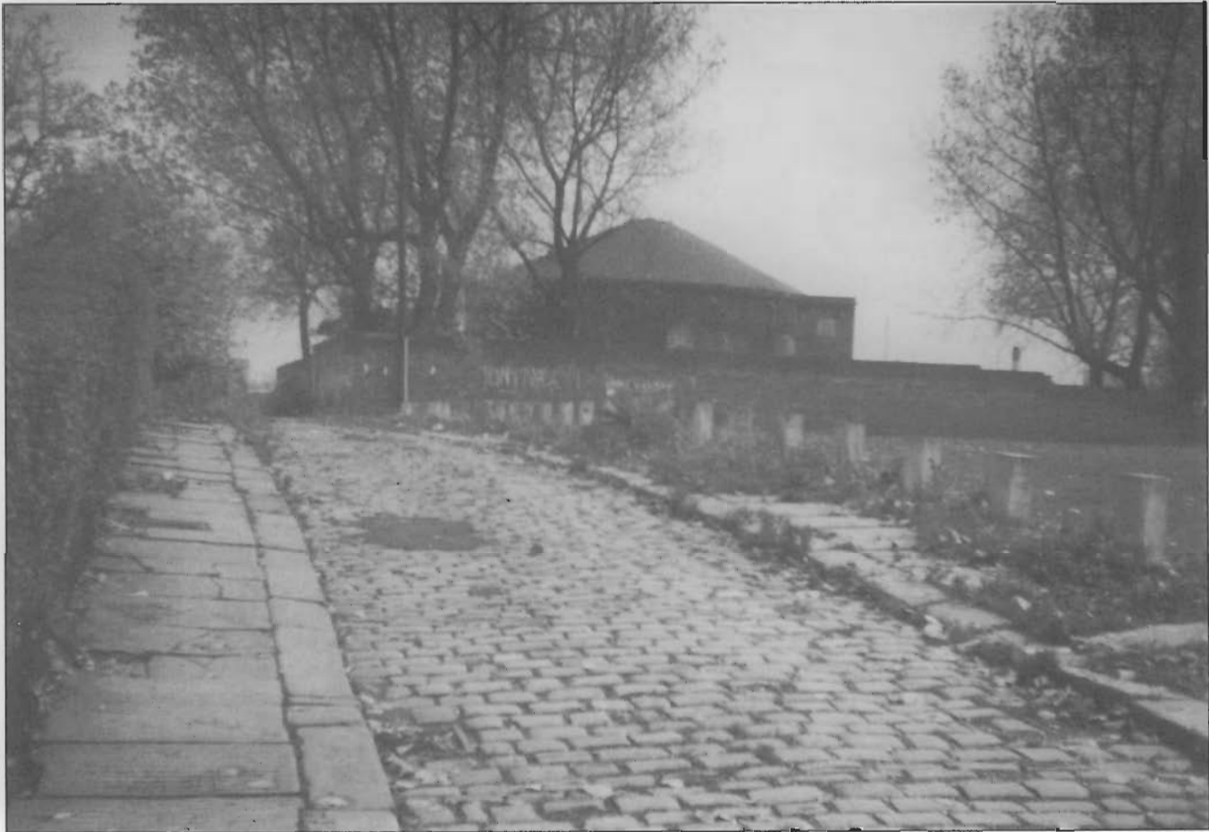
A tiny house in a narrow street. After 60 years, grass and trees have taken over. The ruins of the University Settlement alias the Roundhouse, are in the background.

at the 'we-three-kings-from-the-Oriental' University Settlement. In getting involved with the Roundhouse Settlement, I was playing right into the hands of the slimy old joker in the playing cards, for didn't Mary Stocks herself come on Wednesday to tell young women how not to have babies? And her with the name of Mary! This other Mary, whether cursed or canonised by the women, made us realise that we were surplus brats of unnecessary people bred solely for Heaven or Hell.