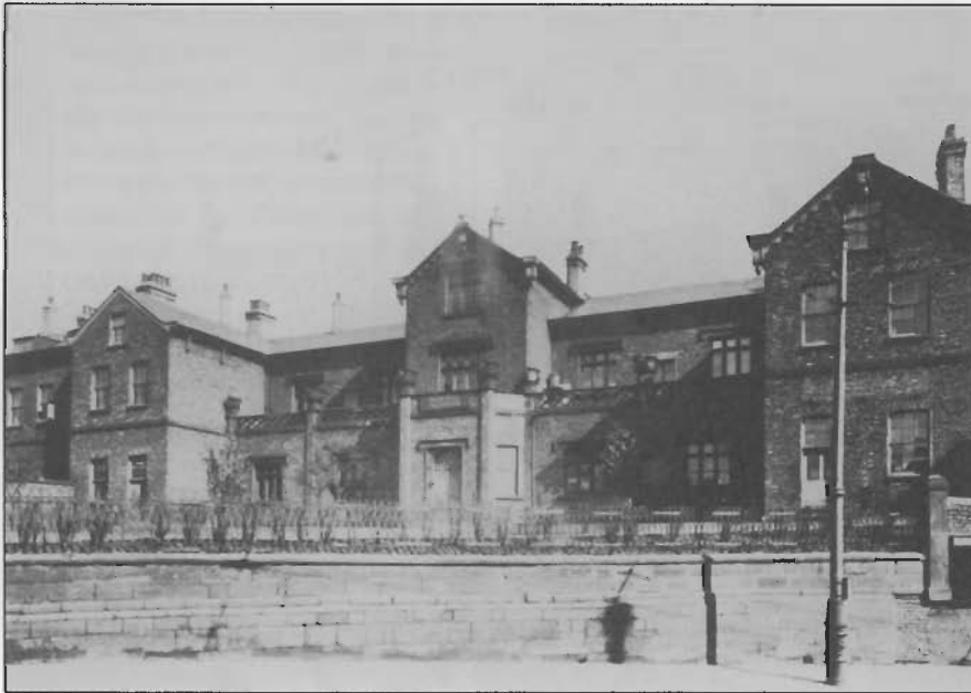
The Horsfall Museum.

Come Christmastime, the small house was strewn with broken toys. I was rich beyond the dreams of Ali Baba. None of the other kids got anything at all and I was able to swap my surplus broken toys for used tram tickets and cigarette cards, which currency we gathered from the gutters and litter-tins.