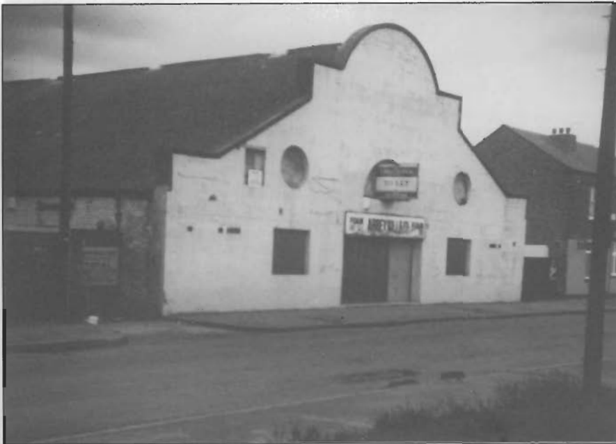
The Palmy: Saturday matinee, one penny.

by swallowing a bottle of bleach or ammonia. Nothing nice or kindly might be said about a suicide because that would be the same thing as sympathising with Satan against God Almighty.