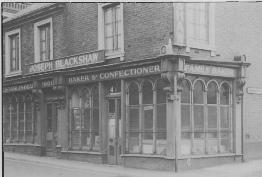
Blackshaw's shop front, Hillgate (now demolished).

Over the years the Society has also produced and supported a number of small research groups: The Photographic Record Group was formed in 1962 to record the changing face of Stockport. Members at this time were also members of the Stockport Photographic Society and in the first year nearly 600 black and white photographs were deposited at the library. 1966 was a very active year due to demolitions in the town. It is unfortunate that many of the buildings that were lost at this time might have been listed if only they had survived until official listing began.