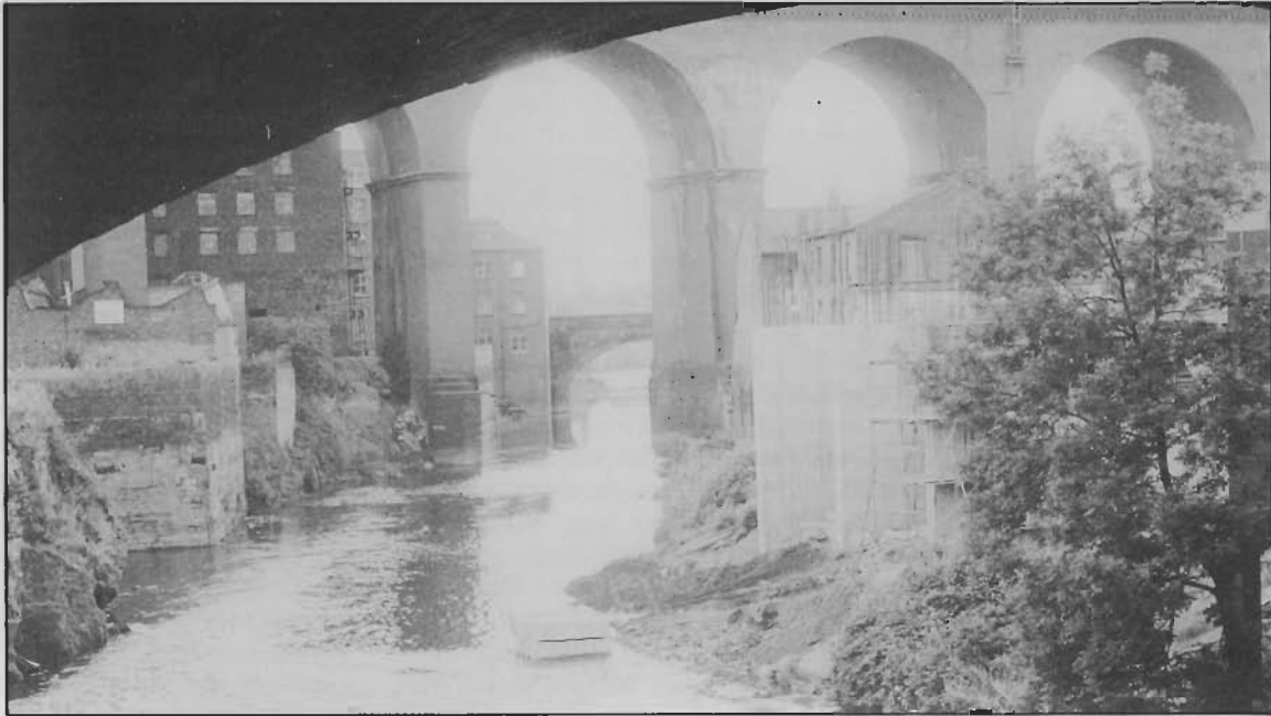
Old and New Stockport under the Viaduct, 1970.