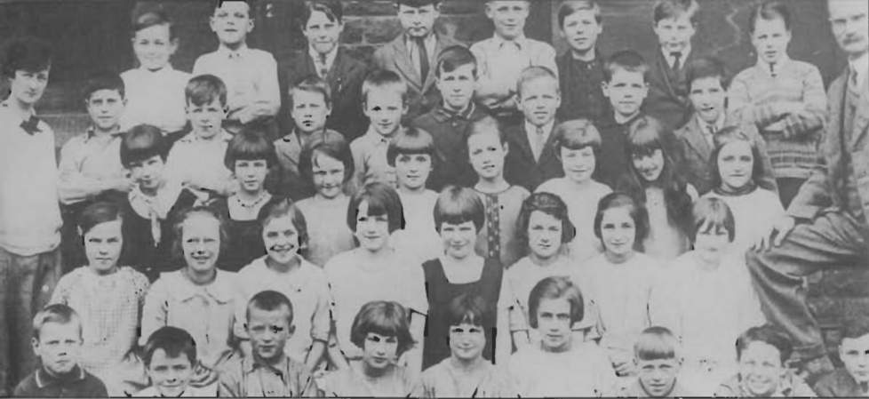
Pupils at Christ Church School, Heaton Norris, 1925.

St. John's churchyard. Heaton Mersey — A Victorian Village 1851-1881 was published in 1985 (now out-of-print). Illustrations for some of the chapter headings, drawn by a group member, were re-used for sets of notelets which sold very well. The group is now inactive.