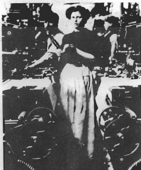
North West Labour History Society Bulletin 7, 1980-81 published in association with the Manchester Women's History Group