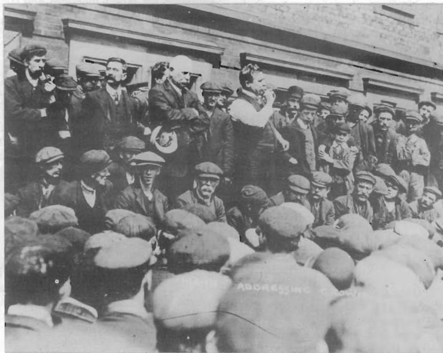
Tom Mann addressing dockers and seamen during Liverpool General Transport Strike, 1911.

Of far greater importance were Sydney and Beatrice Webb. Their prolific writings on social and economic issues, their involvement in the establishment and development of the Fabian Society and their monumental History of Trade Unionism (1894, revised edition 1920) make them a 'tradition' as Asa Briggs once remarked. It is quite extraordinary that a book first published as long ago as 1894 should still be of major importance as a source for labour historians. It was they who 'set the chronology and established a picture of the structure of Labour History