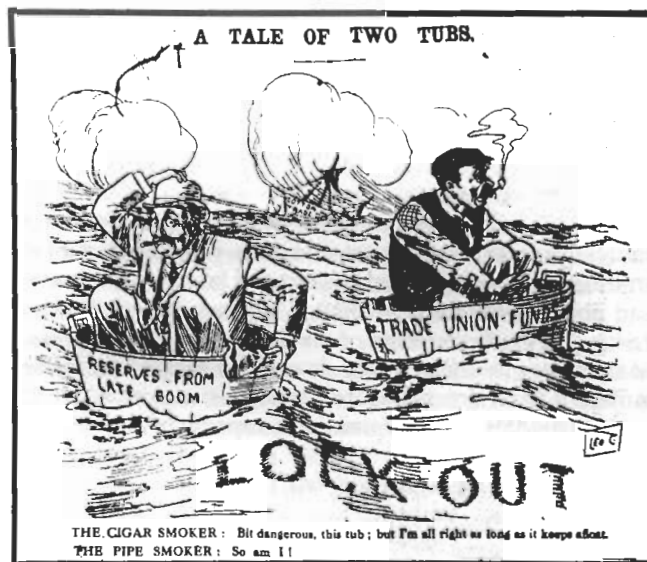
Cartoon during textile dispute, 1908.

Before considering the formation and experience of one regional society it might be instructive to discover why there has been such a sustained development in labour history over the last thirty years. The editors of the national society's Bulletin suggested six possible explanations. Firstly, the 'sheer increase in university population, both students and teachers . . . allows a greater degree of specialisation as well as a wider choice of subjects of special interest'. That observation was made in 1962 and since then the foundation of polytechnics and colleges of higher education has reinforced this trend. Secondly, the 'tendency of academic historians to widen their concept of history as a subject to include social, cultural and other aspects of the life of nations besides the traditional political, dynastic and military history'. Thirdly, the growth in power and importance of labour from 1945 (until 1979 with the onset of the Thatcherite backlash) was bound to lead historians to reflect this by examining the historic role of labour. Fourthly, the development of multi- and inter-disciplinary courses and degrees has brought together clusters of subjects which would normally have to consider some aspects of labour history. Fifthly, the growth in the number of teachers 'with strong sympathies for the political and social ambitions of labour, many of