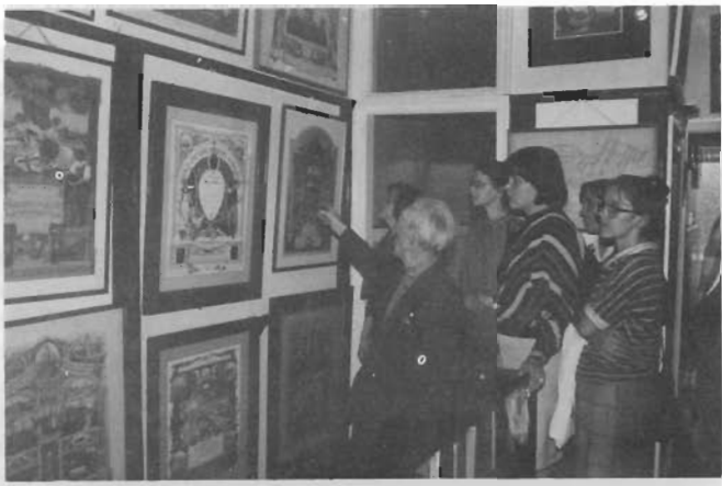
The Landing at Kings Road.

additions to stock, but they felt keenly that the Library should remain in the house for as long as possible because this setting helped to make it unique and attracted users who might be intimidated by a conventional library or record office. When the time came to look to the future, offers of accommodation from several local libraries and educational institutions were considered before the move to Salford was negotiated. In Jubilee House Salford City Council had a building which Eddie and Ruth could envisage as a home for the Library, and where the welcoming atmosphere of the Old Trafford house could be reproduced. A three-storey former nurses' home built in 1897, the year of Queen Victoria's Diamond Jubilee, it has a character very much in keeping with the collection. The City Council, as well as donating Jubilee House, made a substantial contribution to the cost of refurbishing it and undertook to pay the Library's running costs. The Manager and the Chairman of the Cultural Services Committee of Salford City Council were appointed as trustees. The Working Class Movement Library in its new premises was officially opened by the former M.P. for Salford East, Frank Allaun, on 6th November 1987.