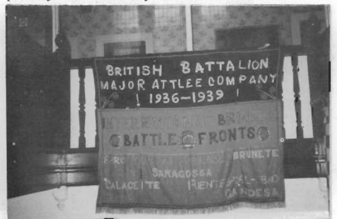
The Landing at Jubilee House.

Fortunately in recent years the value of trade union records to the student of economic and social history has come to be widely appreciated and such records are now being preserved in libraries and record offices nationwide. The collection at the Working Class Movement Library is noteworthy because it combines primary and secondary sources and because of the