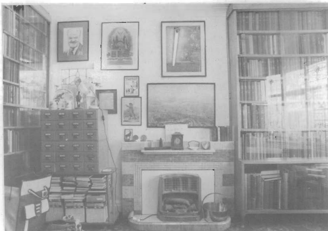
The front room at Kings Road.