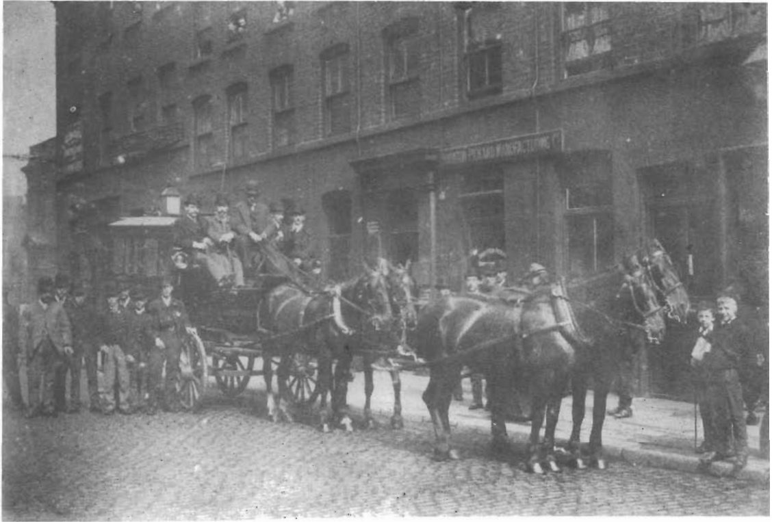
Thornton-Pickard works, St. Mary's Street, Manchester c. 1890.