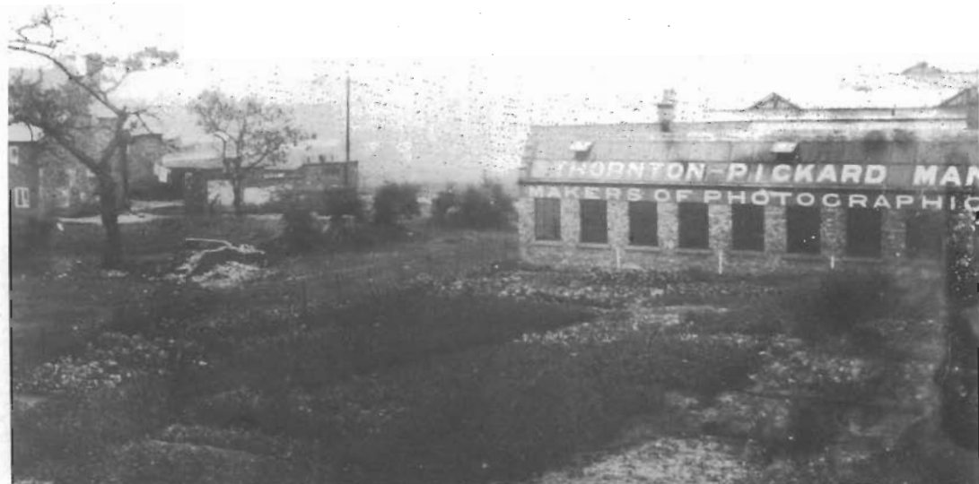
Thornton-Pickard factory at Atlantic Street, Broadheath, Altrincham c. 1892.