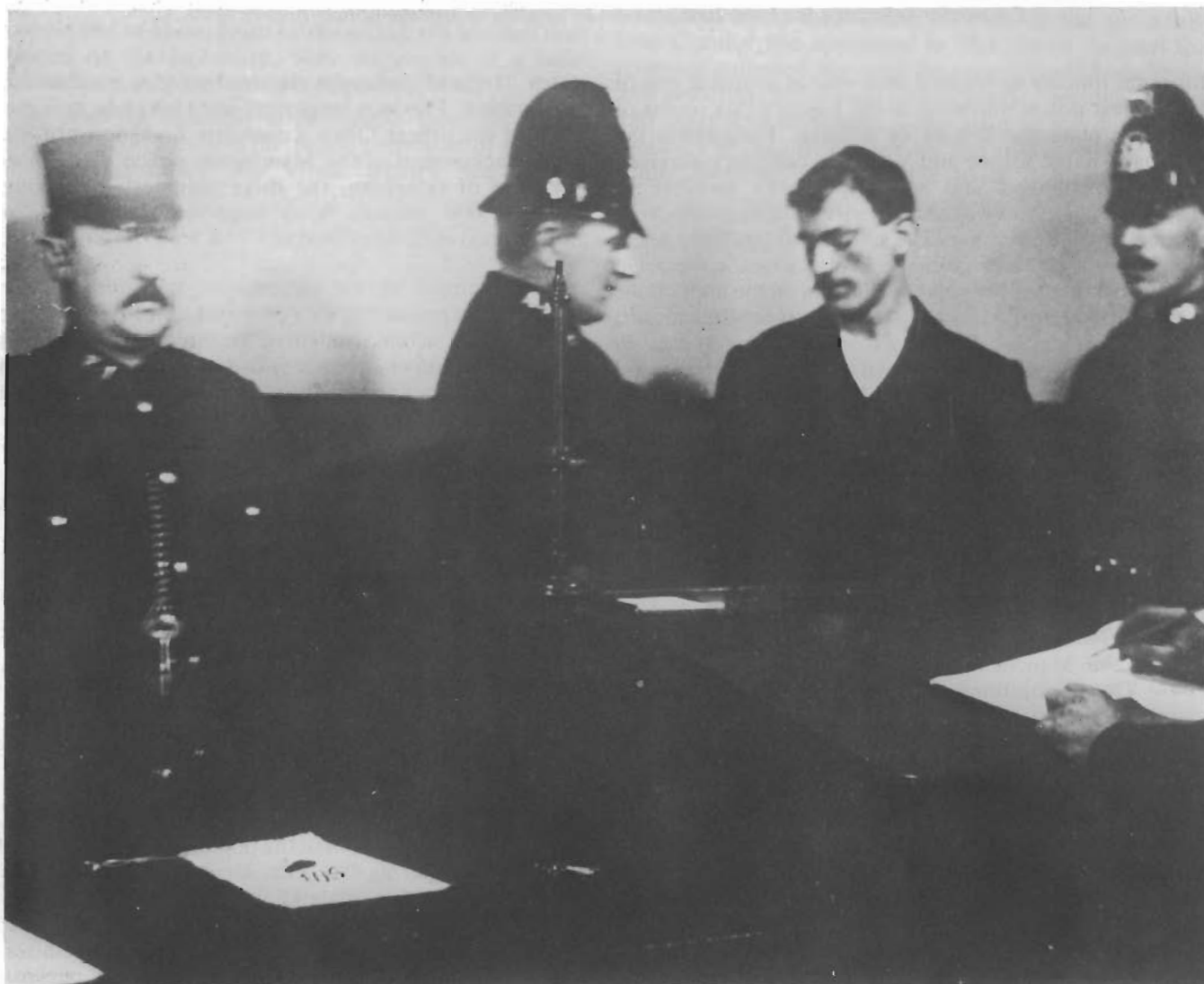
A scene in the Charge Office, 1910.

Fact sheets covering various aspects of police history have been prepared and are available on request. It is the policy of the museum to encourage visits by all age groups including local history societies, school and college parties. In 1986 the museum was visited by over 6,000 people, two-thirds of whom were children. The museum also publishes the Museum Pictorial . In the format of the Victorian 'Penny Dreadful', it contains an assemblage of verbatim articles relating to police and crime from the Victorian period, giving an impression of the mood, attitudes and sometimes prejudices of society at that time. It is hoped that it will be of use to schools studying the period and requiring access to original source material. Access to the museum to view the displays or undertake research is by appointment only. Enquiries should be addressed to: The Curator, Greater Manchester Police Museum, Newton Street, Manchester M1 1ES. Tel. 061-855 3290.